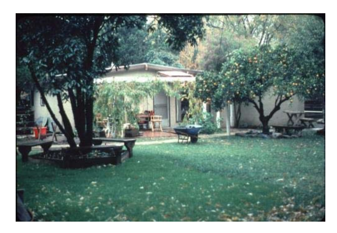
N Street Cohousing – Davis, CA – View from common backyard area <a href="http://directory.cohousing.org">http://directory.cohousing.org</a>